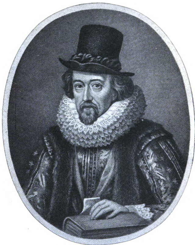
THE RIGHTE HONOURABLE S r Francis Bacon, knight. LORDE HIGHE CHANCELLOVR OF ENGLANDE, and one of his Ma ties most hon ble privie counsell.