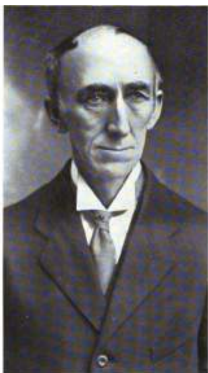
WALLACE D. WATTLES.