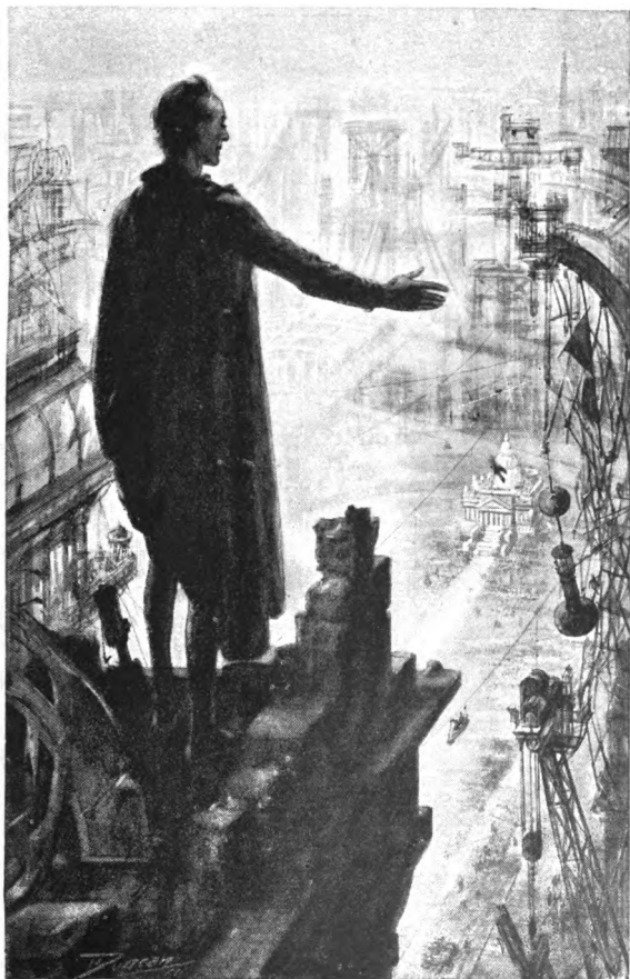
A lonely, tall black figure against the sky.